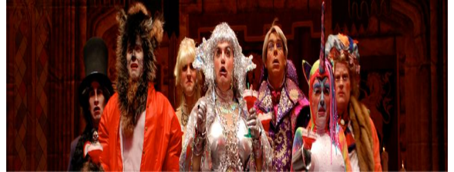
Scene from 2011 Hasty Pudding Theatrical, Kashmir If You Can

I have reserved 65 tickets to the Hasty Puddings Theatricals 164 th annual production, entitled There Will Be Flood . We will be attending the 8:00 PM performance on Thursday, 16 February 2012 at the New College Theatre, 12 Holyoke Street, Cambridge, just outside of Harvard Square (closest T stop is Harvard Square on the Red Line). Tickets are $21.00 each and we will once again be getting seats front and center, in rows 3-5 (another group got their request in before us).