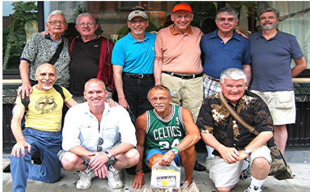
2010 Boston Prime Timers AIDS Walk Team