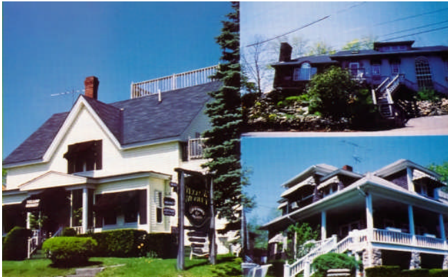
The Yellow Monkey

There are still rooms available for the Boston Prime Timers annual visit to Ogunquit Friday, May 13 th through Sunday, May 15 th , 2011. Please get your tear sheets in by May 5 th or call the office or the Yellow Monkey, directly, to arrange any last minute room reservations. Of the 25 rooms initially rented for the weekend, 32 guys have signed up, who are in 23 rooms, leaving another two rooms for 2-4 more. The rooms we have are suited for single or double occupancy with queen or king beds.