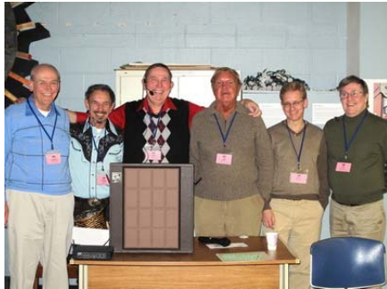
Our New Board In This Issue

Boston Prime Timers, Inc. 566 Columbus Ave, Boston MA 02118-1181 Phone (617) 447-2344 bostonprimetimers@uses.org Current Members 301