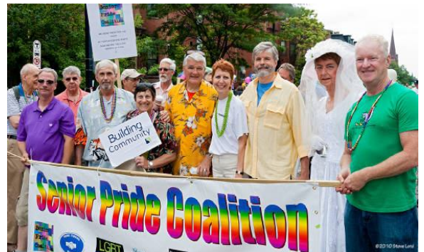
2010 Pride Parade