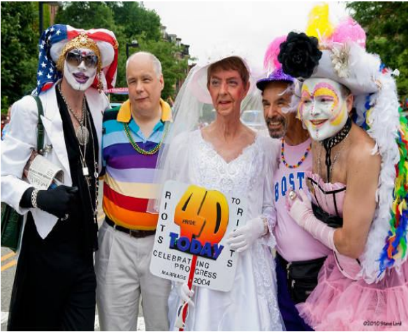
2010 Boston Prime Timers show their true colors