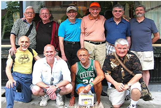
2010 Boston Prime Timers AIDS Walk Team