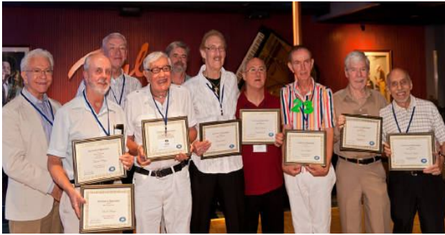
2010 BPT Certificate of Appreciation Recipients

The Boston Prime Timers will celebrate their 24 th Anniversary with a party, Saturday, August 20 th , at the Club Café in downtown Boston. The time of the event is 5:00-9:30PM. There will be a dinner with a choice of different entrees. The BPT Board has decided to keep the cost at $30 per attendee by paying $340 of the organization’s funds for hors d’oeuvres and the dj. Information regarding entertainment and other happenings will be in the July Prologue.