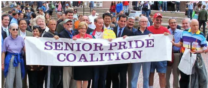
PRIDE FLAG RAISING 2009