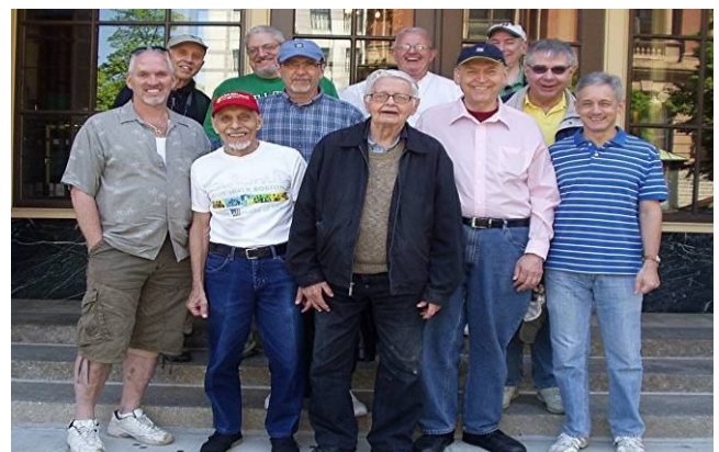
The Boston Prime Timers 2011 AIDS Walk Team walked Sunday, March 5 th . All proceeds aren't in yet but we have already exceeded $900, raised to support those living with the disease.

"The mission of the Boston Prime Timers, founded in 1987, is to provide adult gay, bisexual and transgender men and their friends in eastern New England with educational, cultural and social activities that enrich their lives by building and reinforcing safe, supportive connections for both active and isolated members while continuing our history of developing support among the broader aging and general populations for recognition of the specific needs of men like our members".