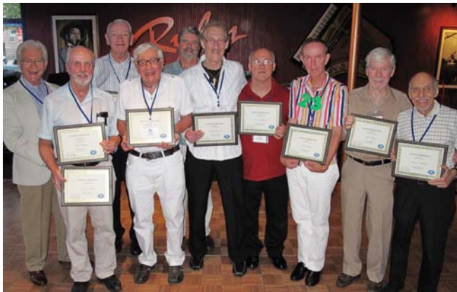
Certificates of Appreciation Boston Prime Timers 23 rd Anniversary Party